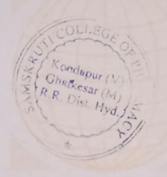
PRINCIPAL Frincipal kruti College of Pharmaindapur (V), Ghatkesar (M), Medchal Dist, PIN-507301

Principal Itskruti College of Pharmar Ondapur (V), Ghatkesar (M), M. Othet Dist. PIN-501301